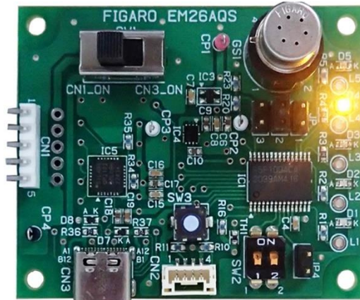
Fig 2. Image of LED lighting (when LED D4 is on.)